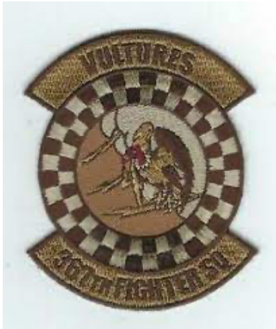
367 Fighter Squadron patch

367 Fighter Squadron (Single-Engine) emblem: On a disc medium blue, a vulture proper, beak dripping blood, perched on one of three golden orange lightning bolts issuing from large white cloud formation in sinister chief; small cloud formations in dexter chief of gray and maroon respectively. (Approved, 1 Mar 1944)