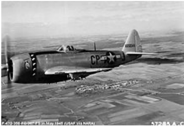
367 FS P-47